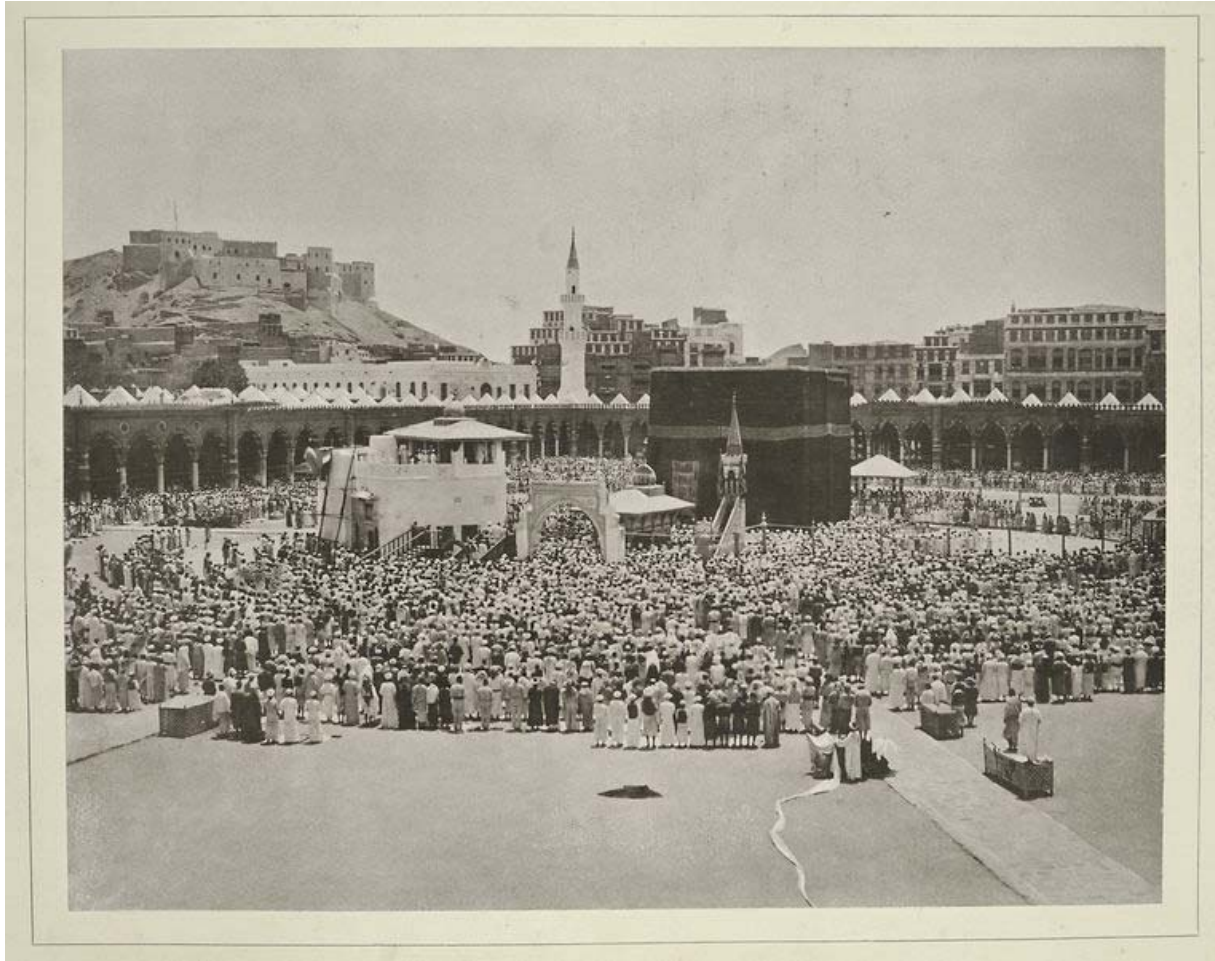
Image 4 The Hajj